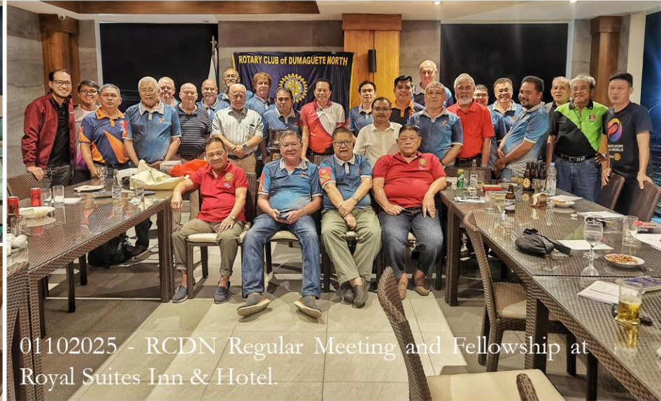
01102025 - RCDN Regular Meeting and Fellowship at Royal Suites Inn & Hotel.